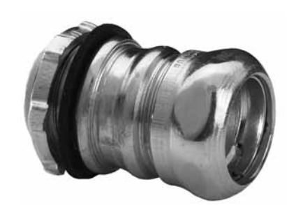
7050SR - 7200SR