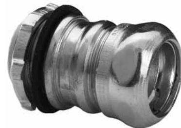
7050SR – 7200SR