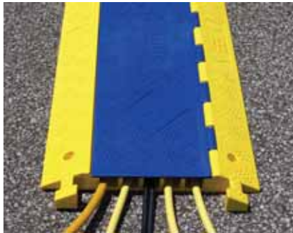
CP5-36-ID : 27,000 Lbs / Axle CP5-36-ED : 50,000 Lbs / Axle