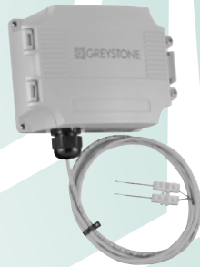
WD-102 - Water Detector c/w Remote Sensor