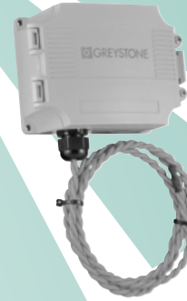
WD-100-XX - Water Detector c/w Conductivity Cable