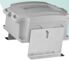
WD-100 - Water Detector Standalone