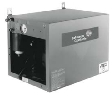
A-4400 Series Refrigerated Air Dryer without Optional Factory Mounted Air Purification System