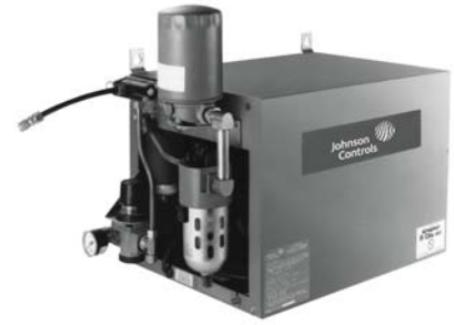
A-4400 Series Refrigerated Air Dryer with Optional Factory Mounted Air Purification System