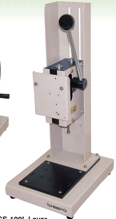
FGS-100L Lever Test Stand