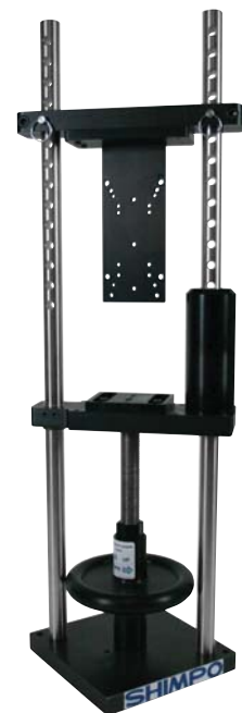
FGS-1000H Hand Wheel Test Stand