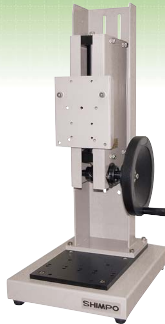
FGS-100H Hand Wheel Test Stand

Nearly all manufacturers' gauges are compatible with Shimpo's test stands for incredible versatility. These stands are designed for precision, balance, and durability. Therefore they are perfectly suited for measuring a limitless range of materials such as, wire, spring, plastic, paper cord, tubing, glass and composites.