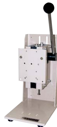
FGS-50S Lever Test Stand